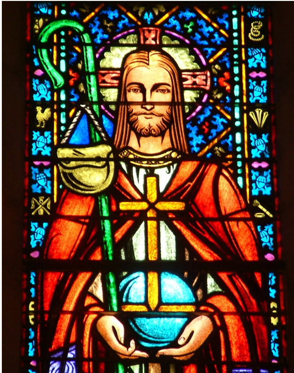
Jesus Christ - the Chief Shepherd

Those who seek colloquy from the Seminary in the hope of becoming certified for the public ministry are required to contact the Seminary through the President. Each colloquy is shaped according to the specific situation of the one applying. You may contact the President by calling the Seminary office (217) 877-2446 or through our website: www.waltherseminary.org