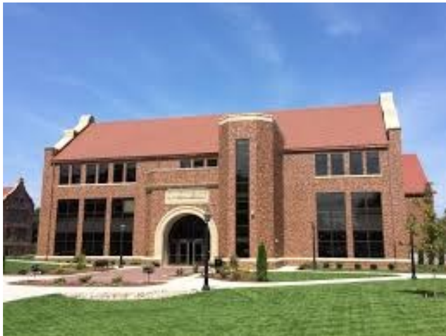
WITH ACCESS TO STALEY LIBRARY AT MILLIKIN UNIVERSITY