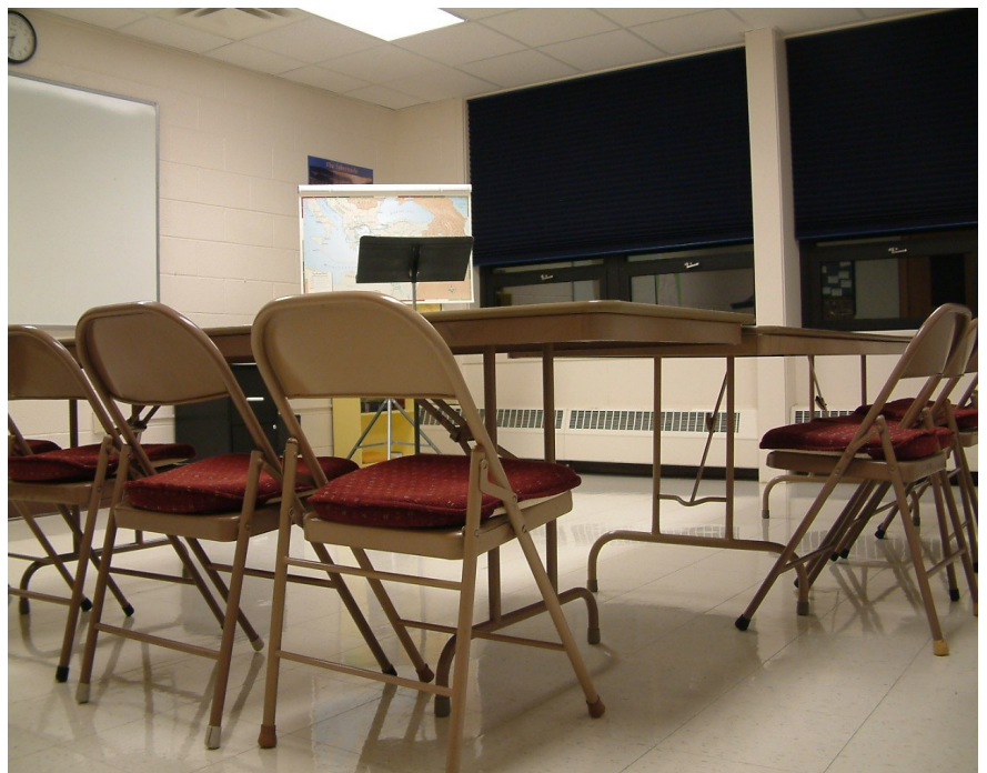
One of many available Classrooms