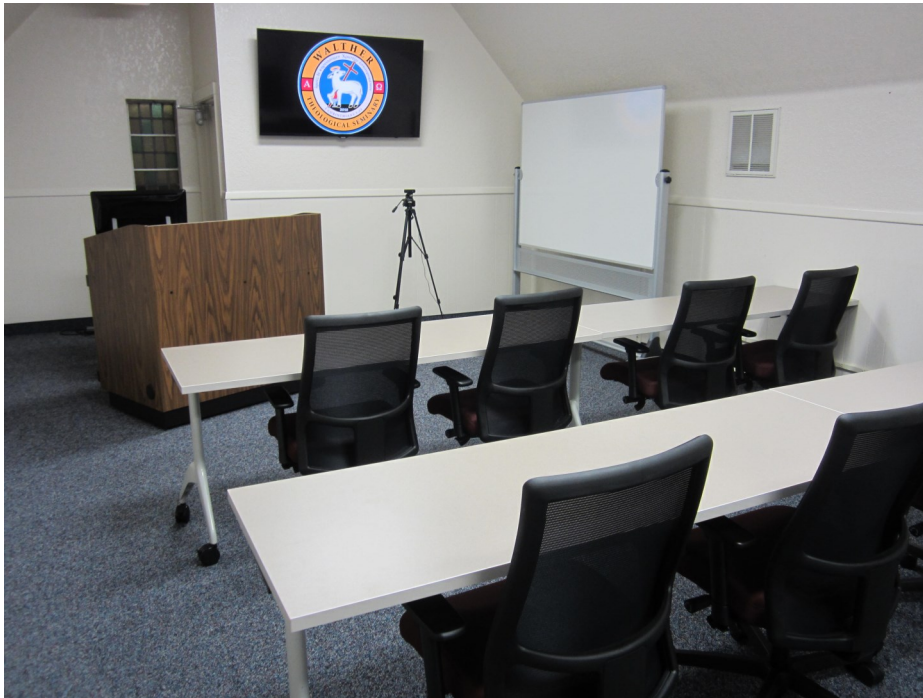
Video Conferencing Room