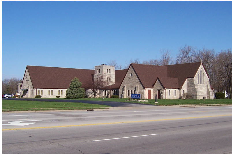
Pilgrim Lutheran Church, Decatur, Illinois

The administration and teaching staff of WTS desires that the Theology of Christ, the apostles, Walther and Luther continues to be taught to future pastors of Evangelical Lutheran churches. One such church that has taken the bold step of making that teaching task a reality is Pilgrim Lutheran Church of Decatur, Il. In 2004, the members of Pilgrim, voted to leave the Lutheran Church-Missouri Synod over doctrinal reasons in order to become an independent Lutheran congregation.