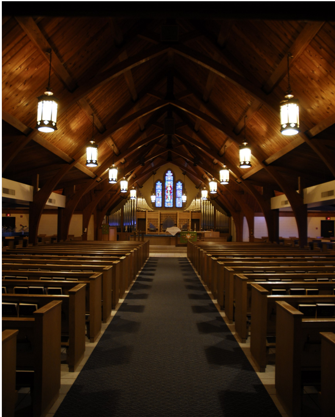
The Sanctuary of Walther Theological Seminary Pilgrim Lutheran Church Decatur, Illinois