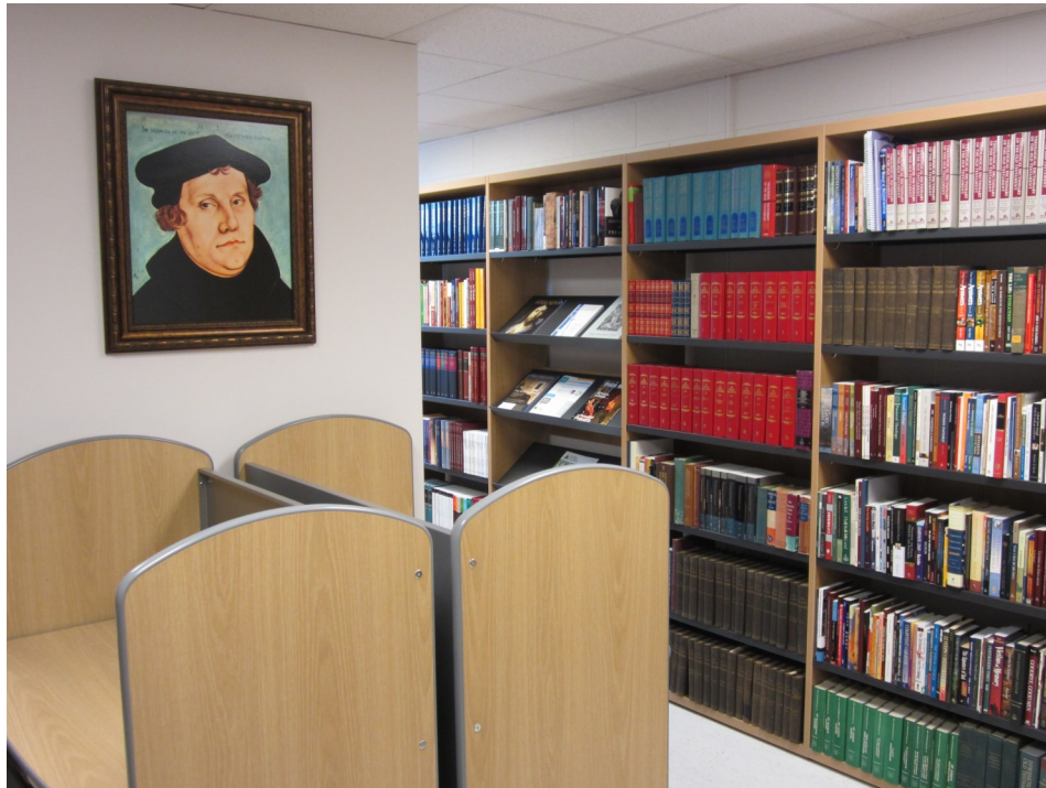
LUTHER LIBRARY at WTS